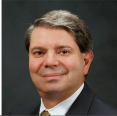
The Honorable Gene L. Dodaro Comptroller General of the United States & Head of the U.S. Government Accountability Office (GAO)

Gene L. Dodaro became the eighth Comptroller General of the United States and head of the U.S. GAO on December 22, 2010, when he was confirmed by the United States Senate. He was nominated by President Obama in September of 2010 from a list of candidates selected by a bipartisan, bicameral congressional commission. He had been serving as Acting Comptroller General since March of 2008.